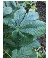
Horse Chestnut Leaf