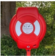
Life Saving Ring