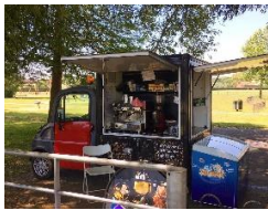
Chugafellas Coffee Van