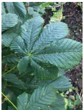
Horse Chestnut Leaf