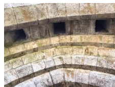
Castle Murder Holes