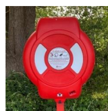
Life Saving Ring