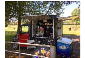
Chugafellas Coffee Van