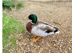
Male Mallard Duck