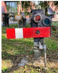
Miniature Railway Signal