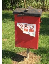
Dog Waste Bin