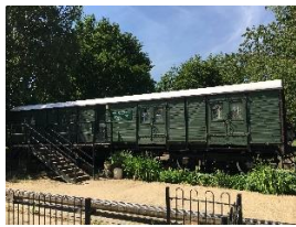
Old Railway Carriage