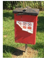
Dog Waste Bin