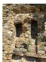
Latrines (Old Castle Toilets)