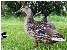
Female Mallard Duck