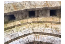
Castle Murder Holes